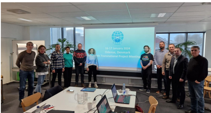
The partners in their last meeting in Odense, Denmark

Now the UMTMS Team is looking forward to the LTT which will held in Denmark in 26 May-1 June 2024 at the same time with the Odense Maritime festival. Odense Maritime Festival is a great dissemination and introduction opportunity for the UMTMS project. Taking place as UMTMS Project Group among international maritime companies in such an explicit organisation might also lead to future partnerships collaboration and cooperation in the sector.